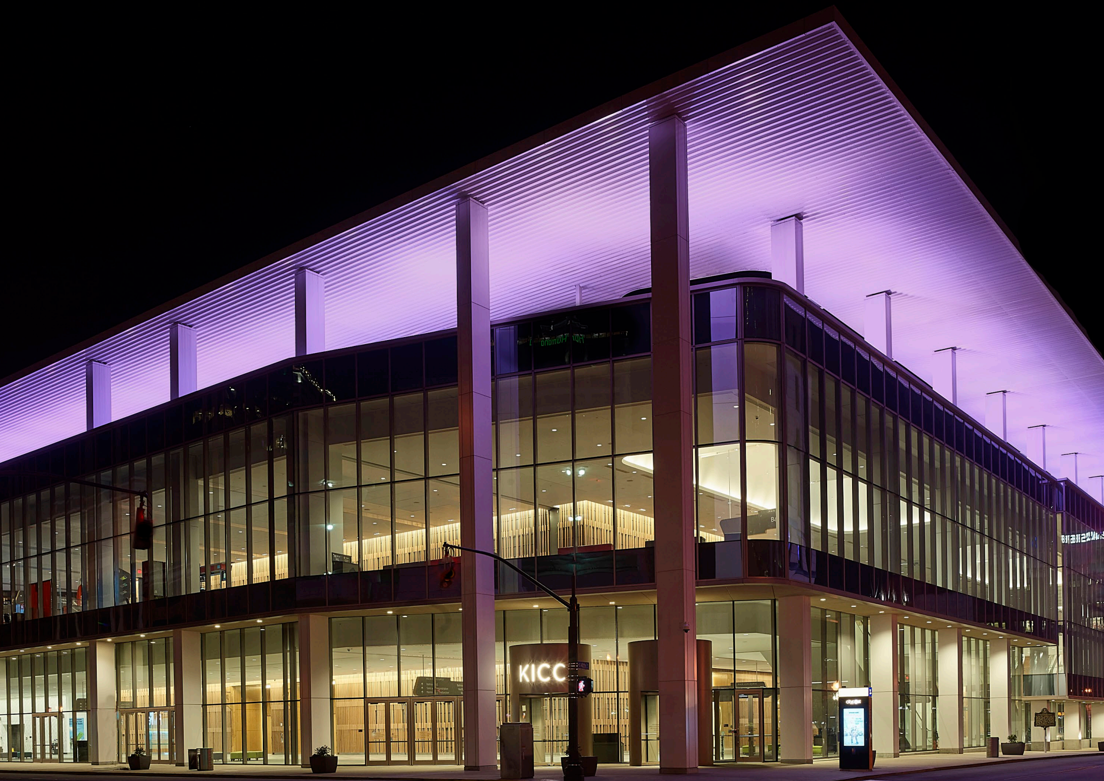
USA_Kentucky International Convention Center, Louisville