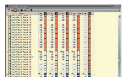
Memories edition's window