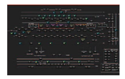
Touchsceen Topographic Layout