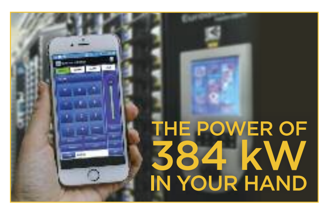
REMOTE CONTROL FOR TWINTECH DIMMER Download the "RDM Dimmer Remote"